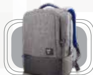
NAVA 15.6" On-trend Backpack